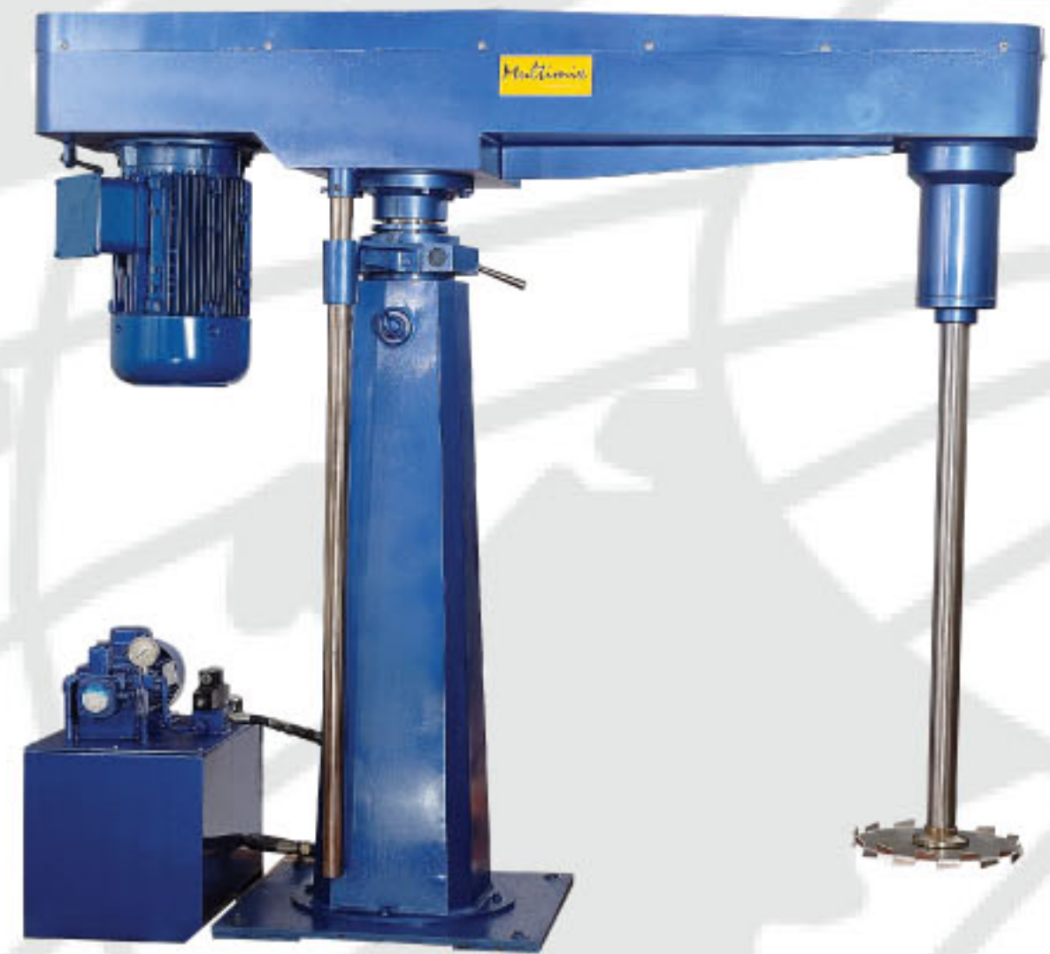
HSD Explosion Proof Type