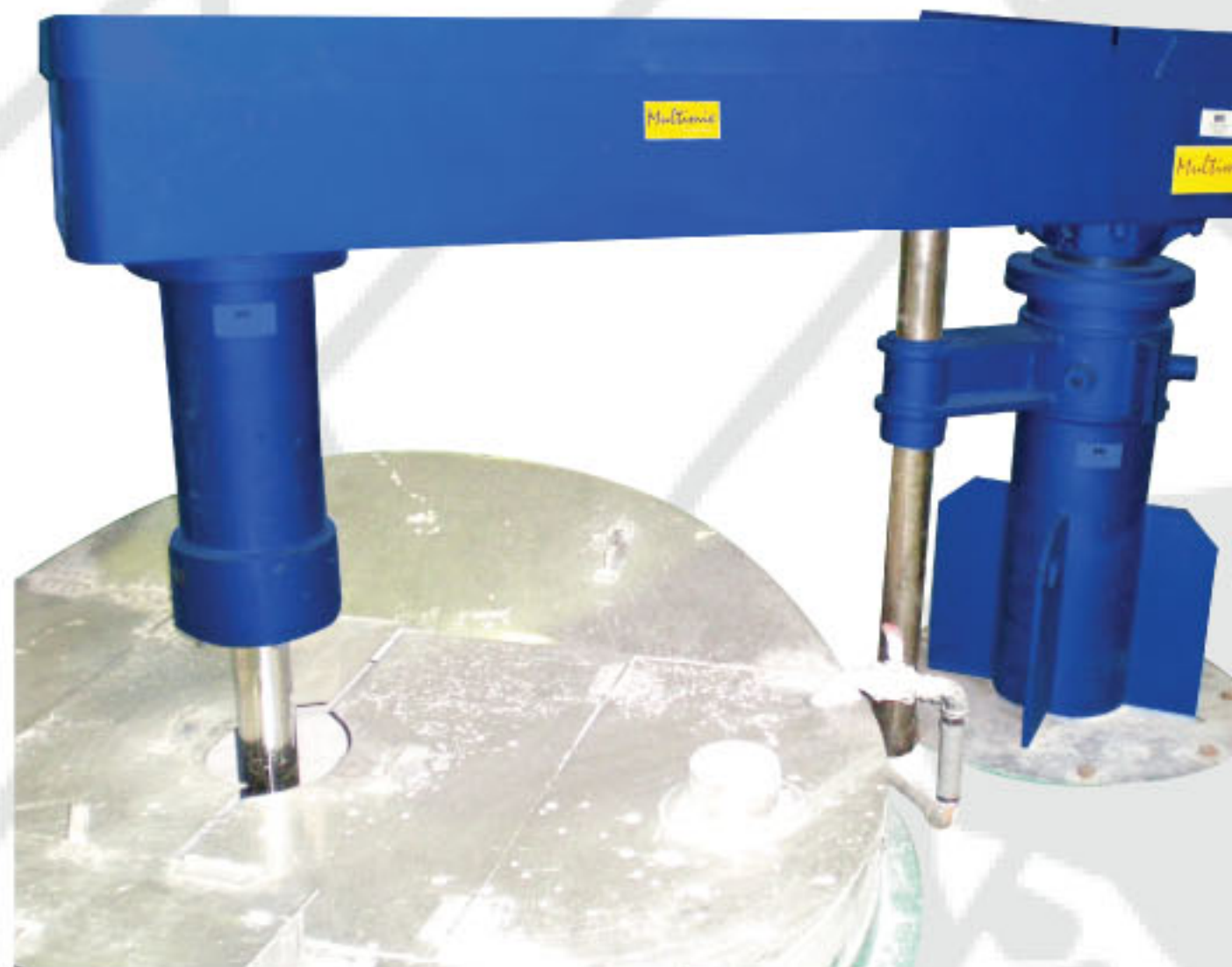
HSD 200 Platform Type