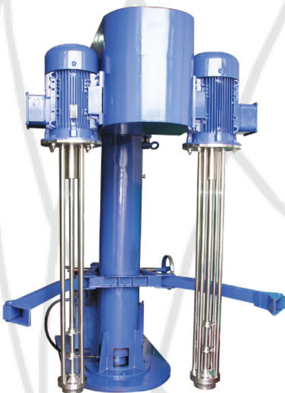
Dual Batch HSM